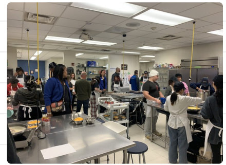
Congratulations Craig Flagler Palms for the Grand Reopening!