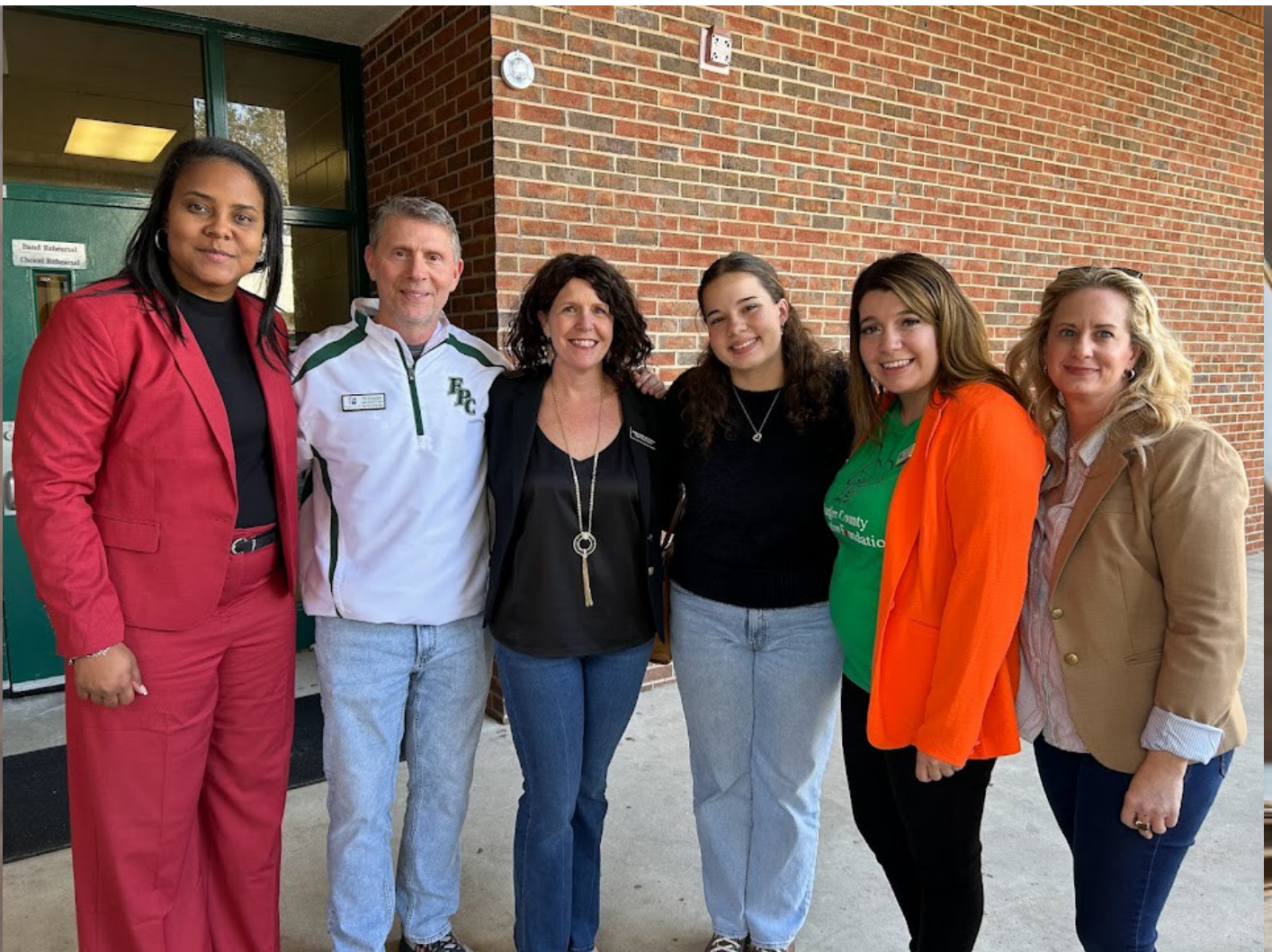
Take Stock in Children Mentor Appreciation Night!